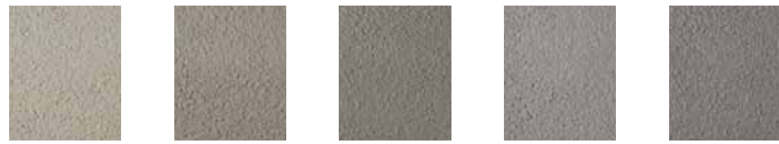
NR-5011R (1 bag) Shadow Gray NR-5010R (1 bag) Gray Cloud NR-5010R (2 bags) Monsoon NR-5157R (1 bag) NR-5157R (2 bags)