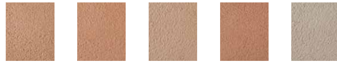
BN-2530R (1 bag) Nutmeg BN-2530R (2 bags) BN-2531R (1 bag) Potter's Clay BN-2531R (2 bags) BN-2681R (1 bag) Willow