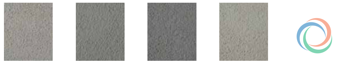
NR-5105R (1 bag) Smoke NR-5105R (2 bags) NR-5105R (3 bags) NR-5171R (1 bag) Midnight Bay