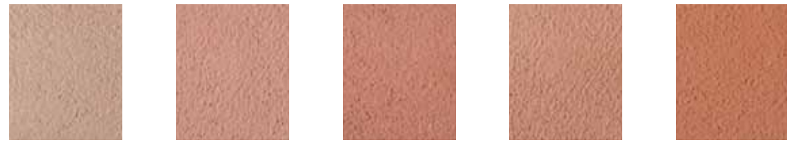
JO-4131R (1 bag) Sahara JO-4134R (1 bag) Orange Blossom JO-4134R (2 bags) Sedona JO-6435R (1 bag) JO-6435R (2 bags)