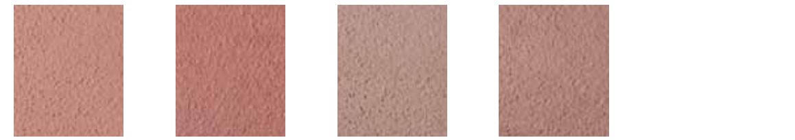
RG-2835R (1 bag) Egyptian Red RG-2835R (2 bags) RG-3077R (1 bag) Redwood RG-3077R (2 bags)