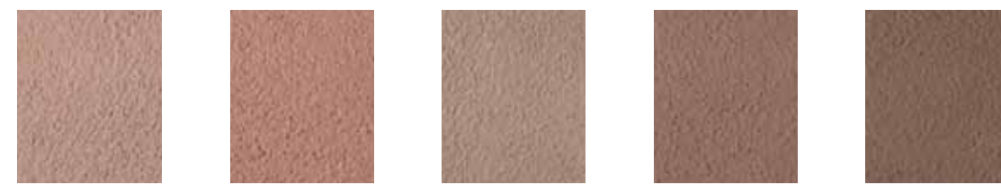
BN-1714R (1 bag) Santa Fe Tan BN-1714R (2 bags) BN-2680R (1 bag) Balsam Wood BN-2680R (2 bags) BN-2680R (3 bags)