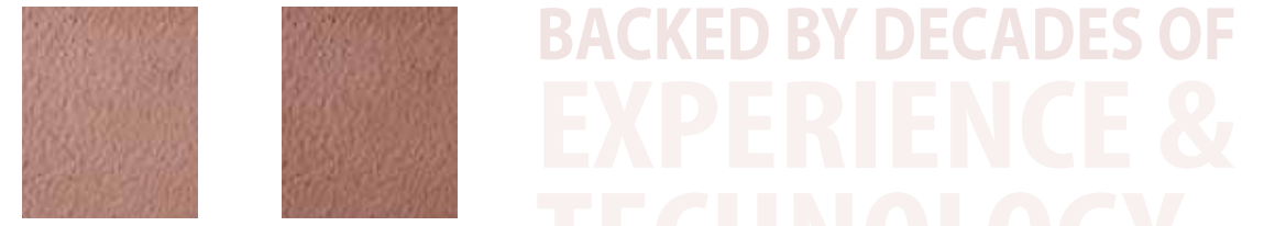
RG-3072R (1 bag) Maroon RG-3072R (2 bags)

BACKED BY DECADES OF EXPERIENCE & TECHNOLOGY