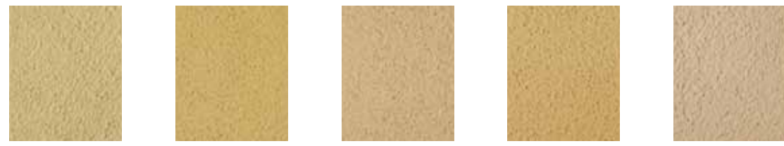
JN-2400R (1 bag) Champagne JN-2400R (2 bags) JN-4010R (1 bag) Gold JN-4010R (2 bags) JN-4411R (1 bag) Bamboo