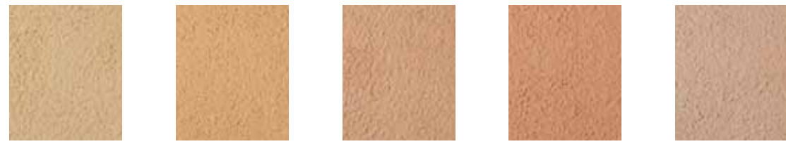
JN-4416R (1 bag) Buff JN-4416R (2 bags) JO-7960R (1 bag) Goldenrod JO-7960R (2 bags) JO-4159R (1 bag) Mystic Shadow