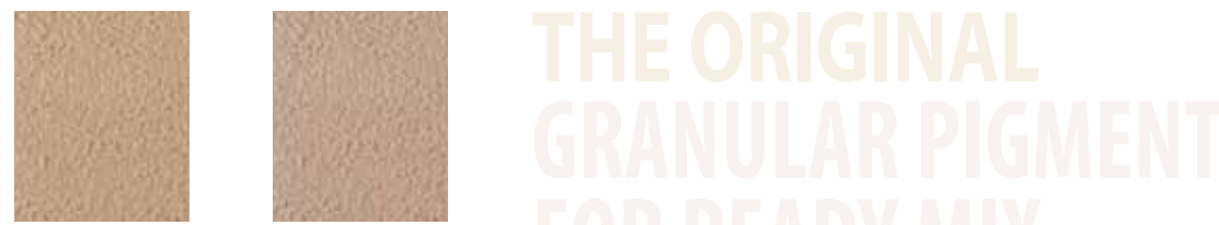
JO-7950R (1 bag) Camel JO-7961R (1 bag) Desert Sand

THE ORIGINAL GRANULAR PIGMENT FOR READY MIX