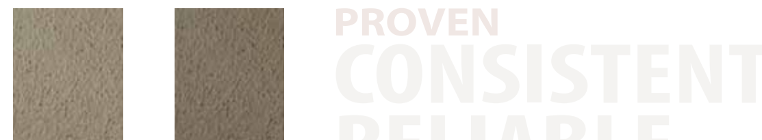
BN-2550R (1 bag) Khaki BN-2550R (2 bags)