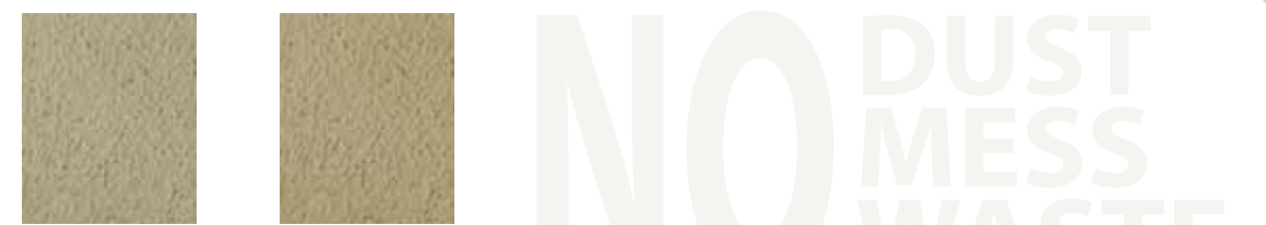
VT-3450R (1 bag) Olive VT-3450R (2 bags)