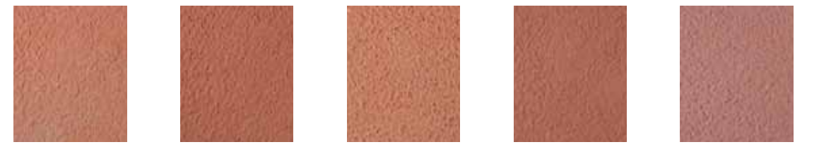
RG-2827R (1 bag) Baja Red RG-2827R (2 bags) RG-2832R (1 bag) Salmon RG-2832R (2 bags) RG-2846R (2 bags) Raspberry