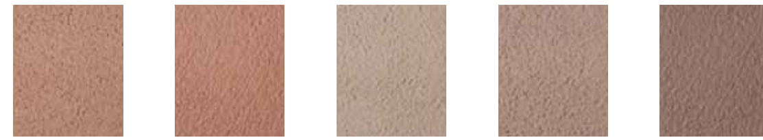
BN-1703R (1 bag) Copper BN-1703R (2 bags) BN-1701R (1 bag) Taupe BN-2520R (1 bag) Chaps BN-2520R (2 bags)