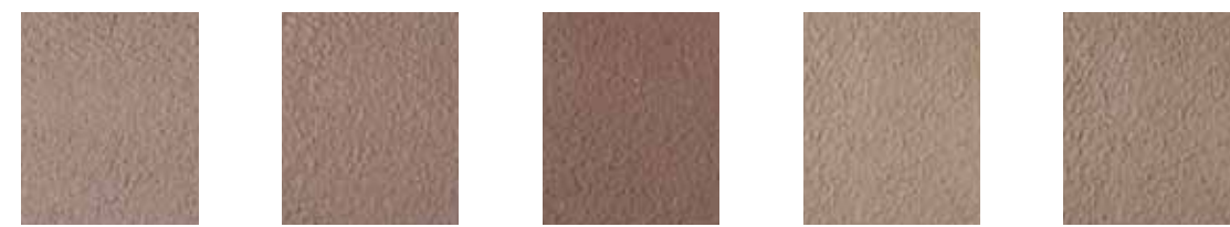
BN-2510R (1 bag) Maple BN-2510R (2 bags) BN-2510R (3 bags) BN-2978R (1 bag) Chocolate Fudge BN-2978R (2 bags)