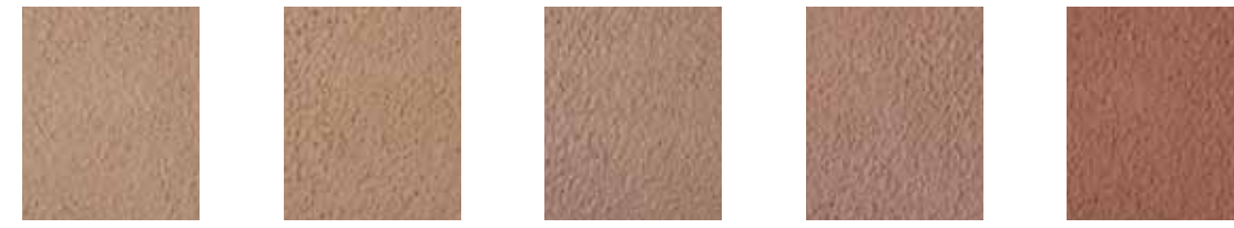
BN-1705R (1 bag) Rustic BN-1705R (2 bags) BN-1711R (1 bag) Hazelnut BN-1711R (2 bags) BN-1711R (3 bags)