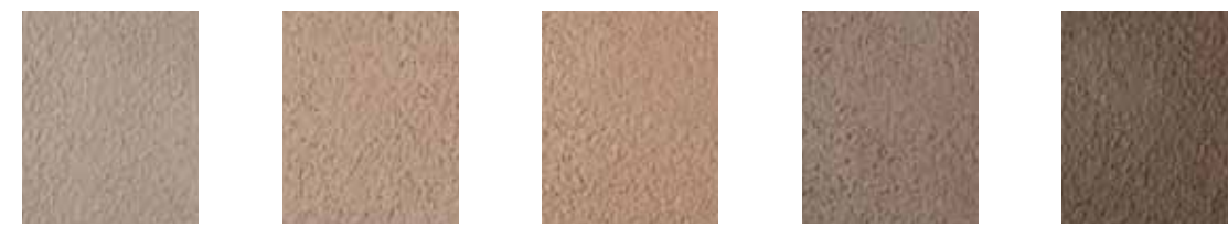
BN-2730R (1 bag) Biscuit BN-2739R (1 bag) Stone Castle BN-2739R (2 bags) Plum BN-1616R (1 bag) BN-1616R (2 bags)